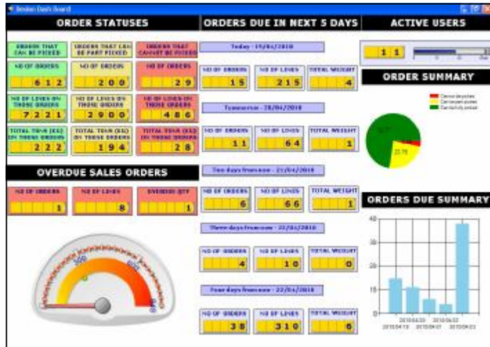
Dexterity Dashboard: A snapshot of the entire operation at a glance.